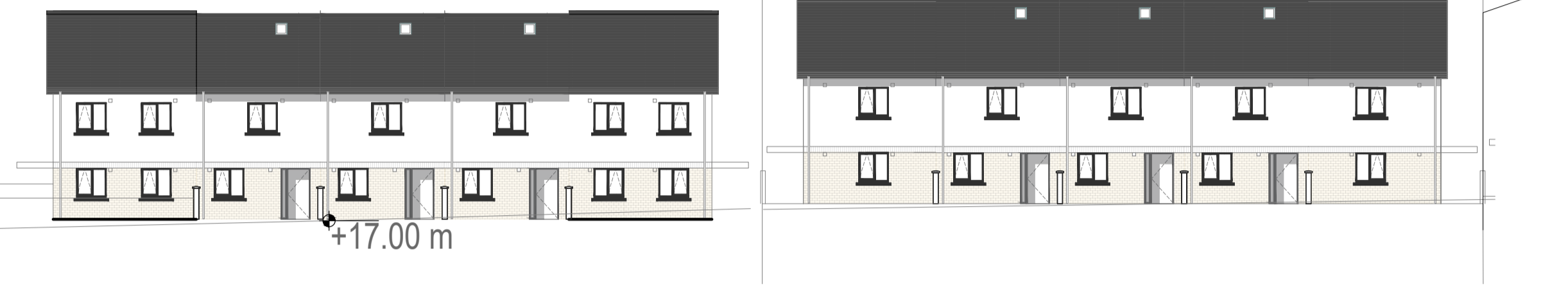
F-F ELEVATIONS- PART 1