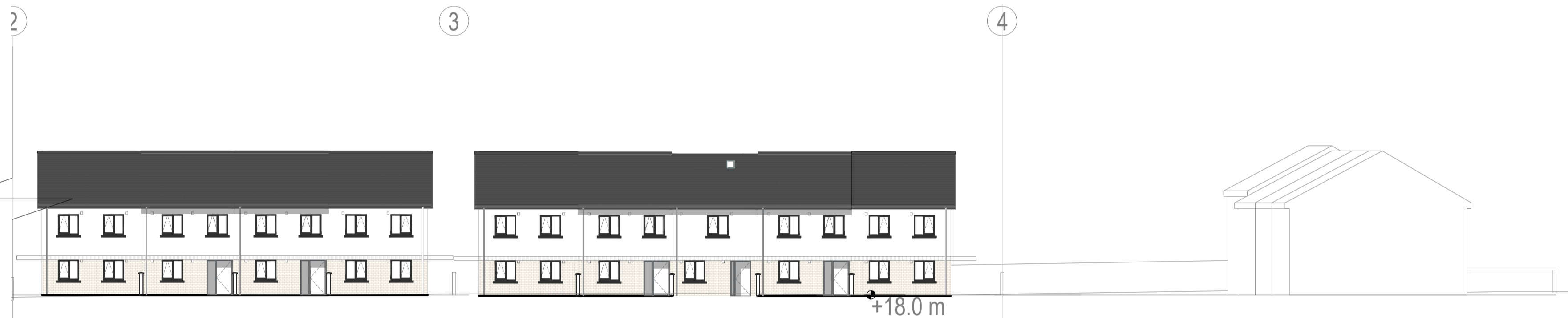
F-F ELEVATIONS- PART 2